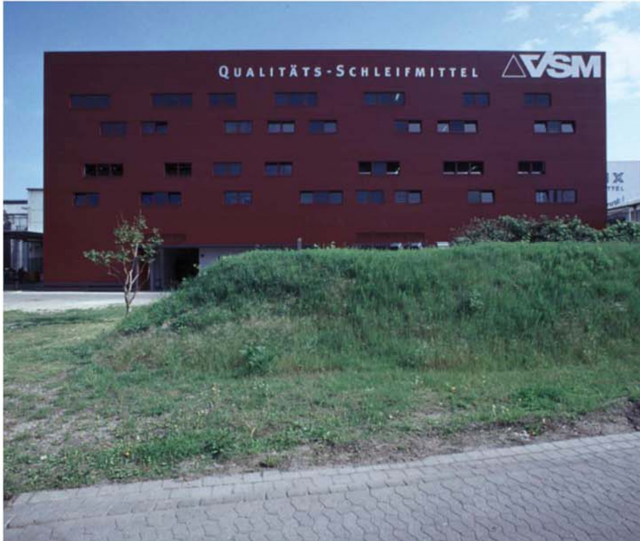
↑ | Front elevation